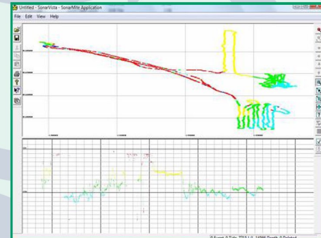
SonarVista Processing Software